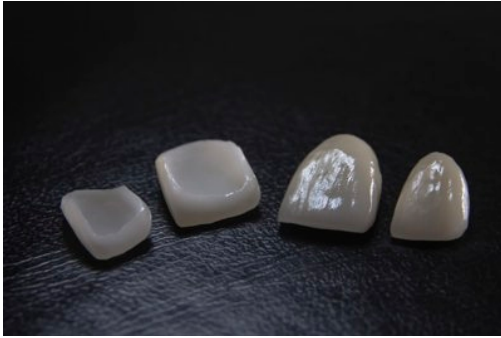
Zirconia Layered Veneer