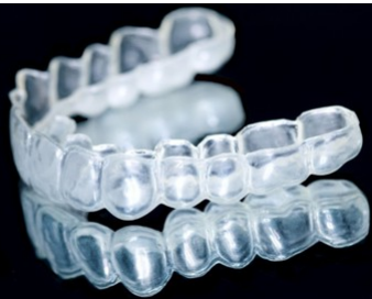
Bleaching Tray $15