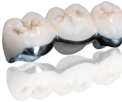
PFM Base Alloy Ni Free (alloy included)