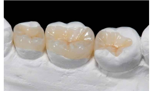
Zirconia Inlay / Onlay