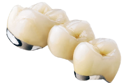
PFM Semi-Precious (plus gram of alloy)