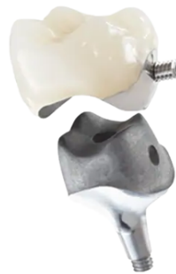
PFM Cr-Co with Titanium Custom Abutment