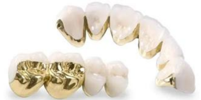
PFM High Noble White (plus gram of alloy)

A variety of PFM options and materials for your restorations.