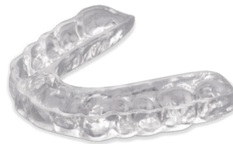
Night Guards $65 Soft, Hard or Both