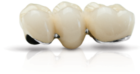
PFM Based Alloy (alloy included)