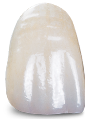
Zirconia Layered Crown