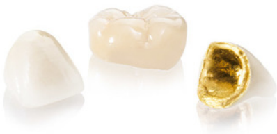
Captek (single unit only)