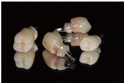
E. Max Crown with Zirconia Custom Abutment