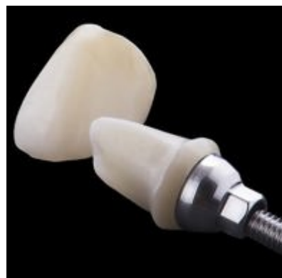
Zirconia Layered with Zirconia Custom Abutment