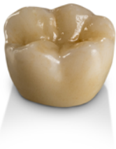
Monolithic Zirconia Crown