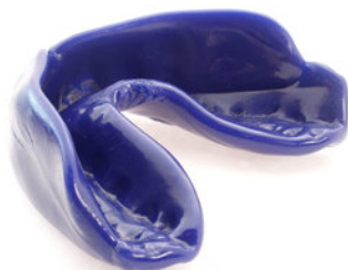
Sport Guard $69