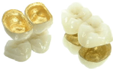
PFM High Noble Yellow (plus gram of alloy)