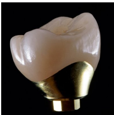
Zirconia Layered with Titanium Custom Abutment